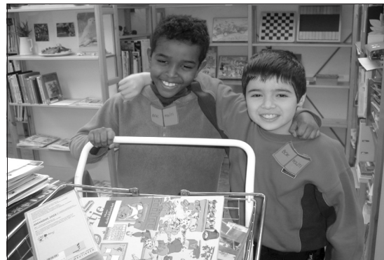
Plate 7 The book police

In Norway drama is taught as a discipline in parts of secondary school and also in teachers' training colleges. But in Norwegian primary schools drama is not treated as a discipline like music and art, it is only a method used in subjects such as English, Norwegian and religion. This is surprising because there is a long international and Norwegian tradition in the pedagogics of drama starting with John Dewey (1859-1952) and his emphasis on "learning by doing", through the advocacy of children's play by Lev Vygotskij (1896-1934), creative dramatics (Elsa Olenius 1896-1984), dramatisation (Helga Eng 1875-1966) right up to