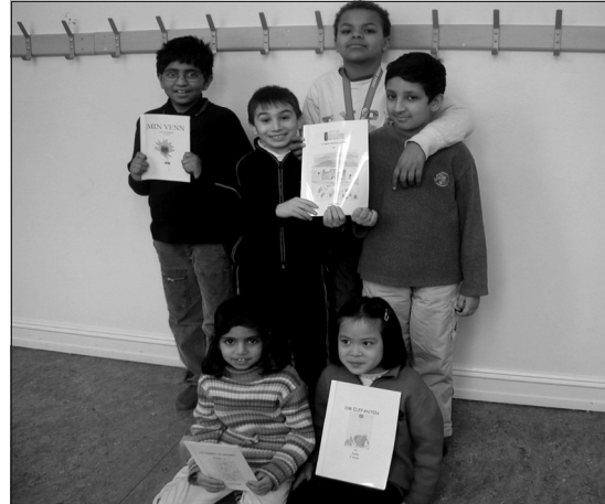
Plate 6 Proud new authors

directory. In several cases pupils have proudly recounted that after having received their book certificates, they have helped their mother's make phone calls. Two children from each class from 4th to 7th grade serve as book police (see Plate 7). This is a very popular job for which pupils must present written applications. When recruited, the book police act as library assistants and wear red book police badges, moving around school with a book trolley gathering in books that have to be returned to the library.