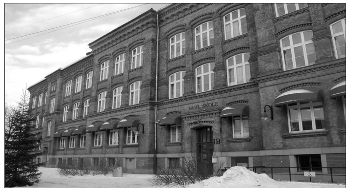
Plate 1 Vahl Primary School, Oslo

An interesting feature of all Norwegian primary and secondary schools, is the institution of the school council which is composed of elected pupil representatives (see Plate 2). The council serves many purposes, one of which is to provide an early training ground for later political participation. The school council regularly communicates and interacts with the school board and thereby takes