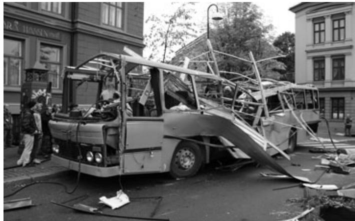
Figure 1. Photo of bombed-out bus

Exercise Oslo 2006 is Norway's civilian-led crisis simulation. The exercise, a response to the events of 9/11 and terrorist attacks in Madrid and London in 2004-2005, is analyzed here using the frameworks of crisis communication. Based on participant observation and interviews, the author evaluates the experience and recommends applications for future media game exercises.