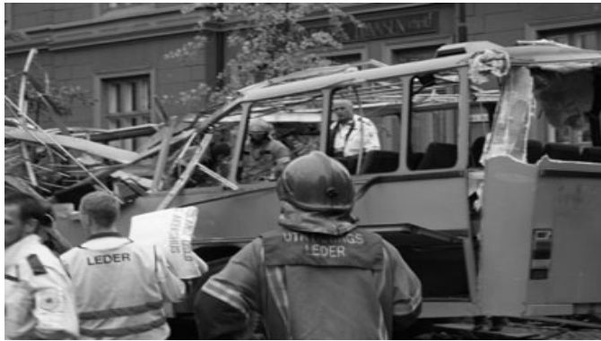
Figure 8. A train, a bus and a tram exploded in Oslo yesterday.