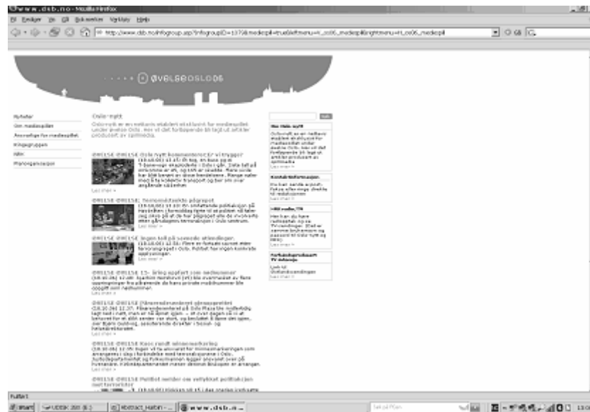
Figure 3. Front page of Oslo News

The five embassies (UK, Denmark, Finland, Iceland, Pakistan ) involved themselves as far as their own citizens were concerned, but they were in many cases not able to respond optimally to the media due to lack of information from Norwegian authorities.